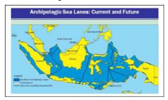
Figure 2. ALKI Maps 1,2, and 3.

Lanes (ALKI) as shipping and flight routes by international ships or aircraft. The three ALKIs are passed by 45% of the total world trade value or reaching around US $ 1,500. However, this valuable geographical position has not been put to good use. Evidently, Indonesia does not yet have transit ports for ships international trade that passed the 3 ALKI earlier. Even though the ALKI route is a congested route, either shipping from China to Europe or Australia, or vice versa, because there is no other route apart from passing ALKI in Indonesia. This should be a strength for Indonesia.