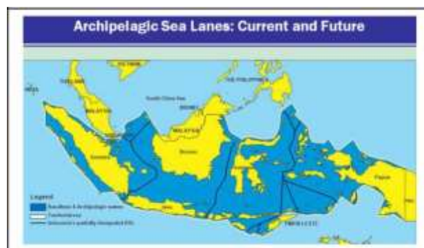
Figure 2. ALKI Maps 1,2, and 3.

Lanes (ALKI) as shipping and flight routes by international ships or aircraft. The three ALKIs are passed by 45% of the total world trade value or reaching around US $ 1,500. However, this valuable geographical position has not been put to good use. Evidently, Indonesia does not yet have transit ports for ships international trade that passed the 3 ALKI earlier. Even though the ALKI route is a congested route, either shipping from China to Europe or Australia, or vice versa, because there is no other route apart from passing ALKI in Indonesia. This should be a strength for Indonesia.