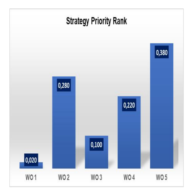
Figure 2. Priorities and Rank Strategy

Based on the results of the calculation of the strategy weights using the Borda method, the strategic priority order of the comparison chart is shown in figure 3.2 as follows: